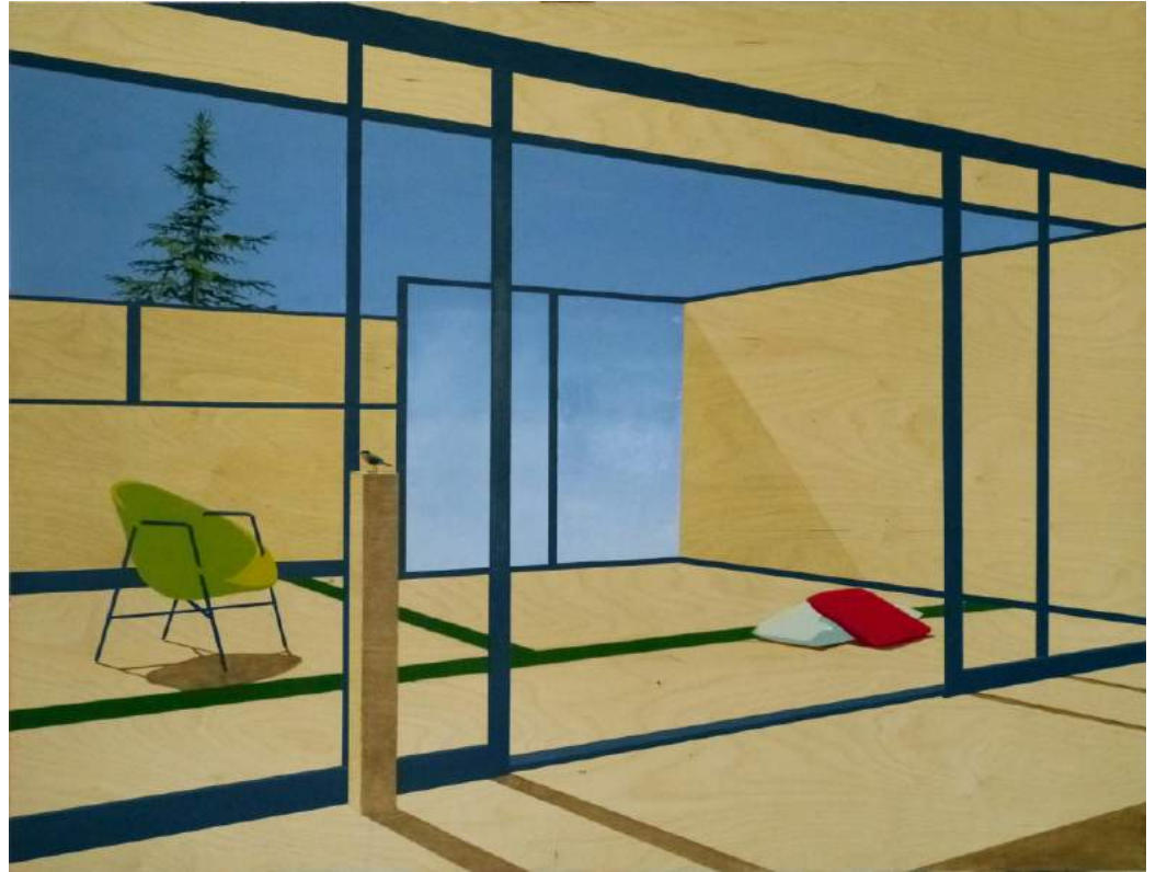
Blaise Drummond The Apartments , 2019

Oil, collage and beeswax on birch ply 48 × 63 3/8 in Inv. No. : BD190303