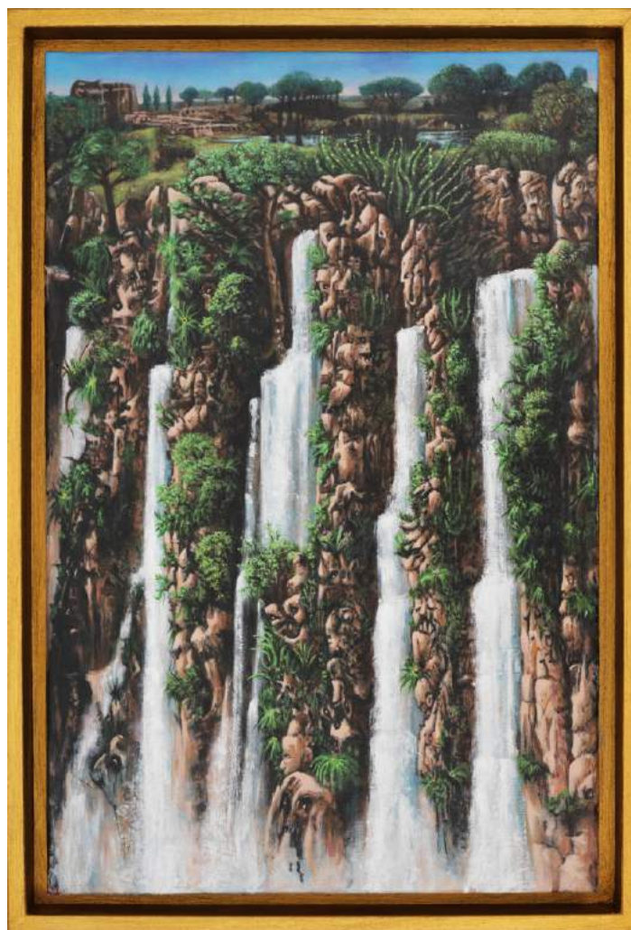
Philippe Mayaux Paysage uthiopique , 2020

Mixed media on canvas 16 1/8 x 10 5/8 in Inv. No. : PM201209