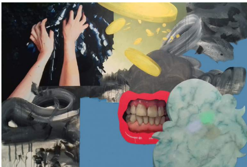
Ashley Hans Scheirl Investor's Marble Fever , 2017

Acrylic on canvas 66 15/16 × 98 7/16 in Inv. No. : AHS170712