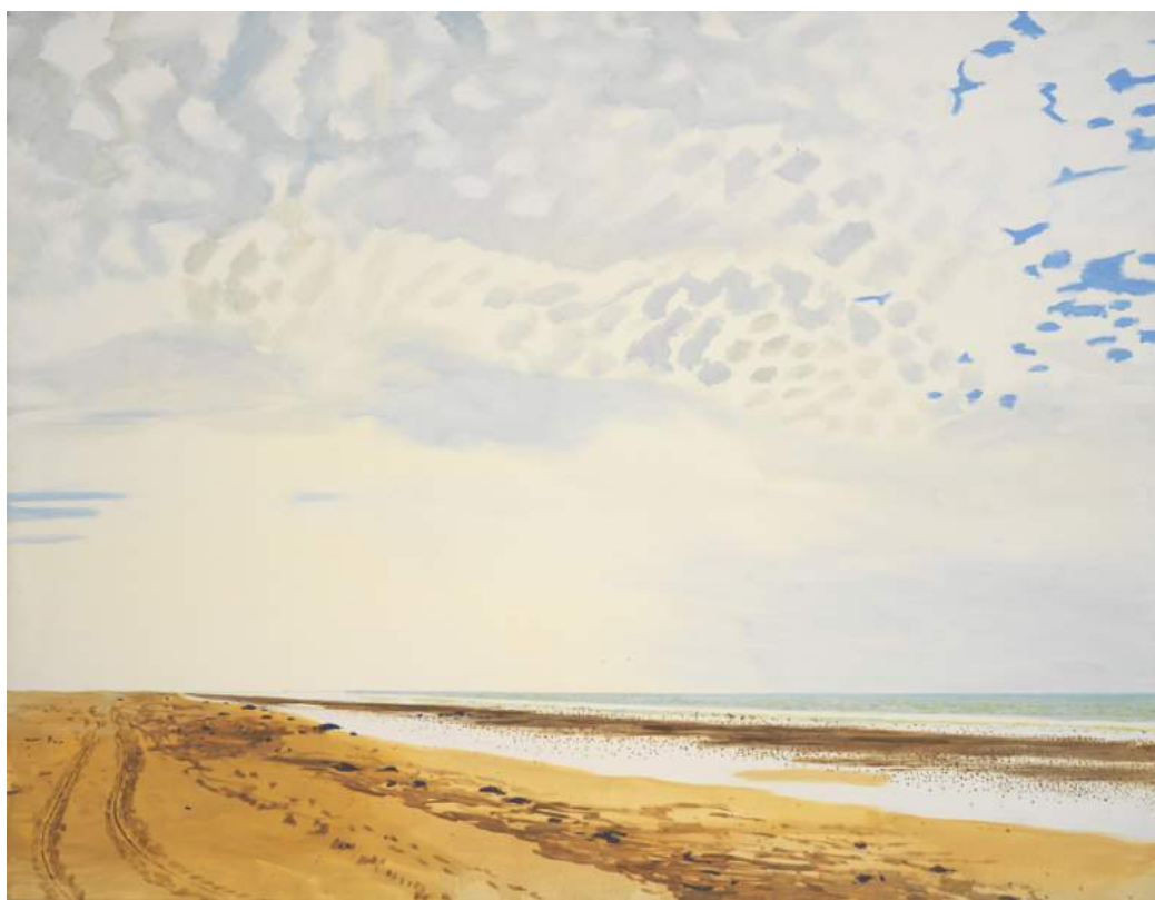
Gilles Aillaud Plage d'Hauteville, 1990

Oil on canvas 78 3/4 × 102 3/8 in Signed and dated Courtesy galerie Loevenbruck, Paris Inv. No. : GA200202