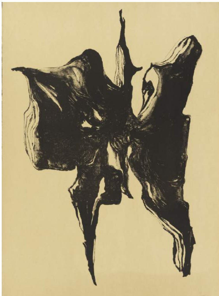
Alina Szapocznikow Bez Tytułu , ca. 1961

Monotype and ink on beige laid paper watermarked 'INGRES'