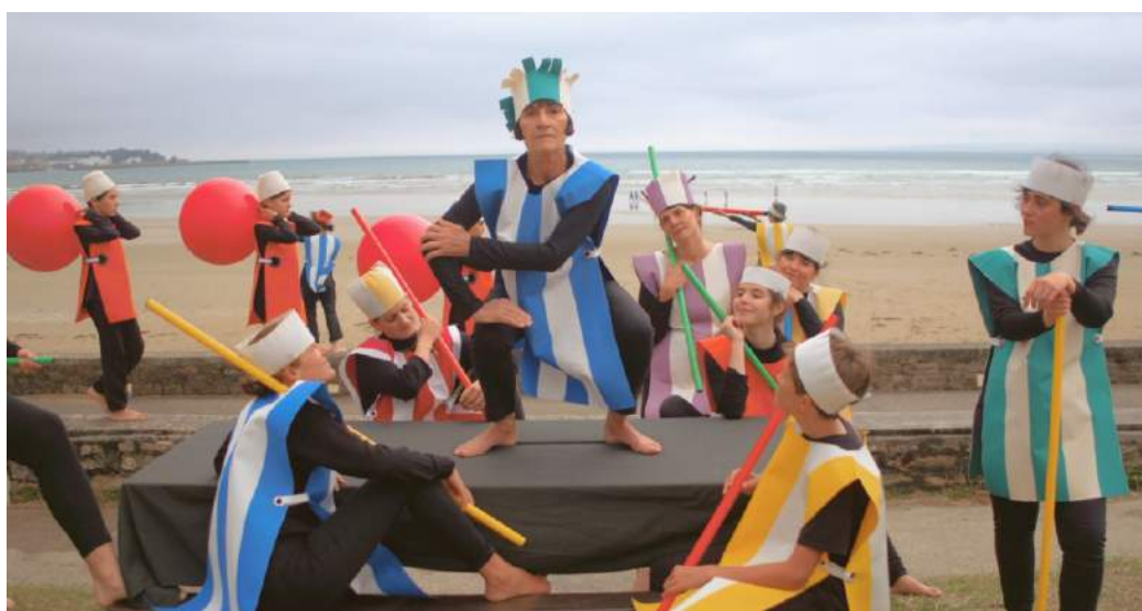
Virginie Barré Le rêve géométrique , 2017

Film, colour, sound – Runtime: 13'31" – Produced by: 36secondes Ed. 2/5 Courtesy galerie Loevenbruck, Paris Inv. No. : VB180969