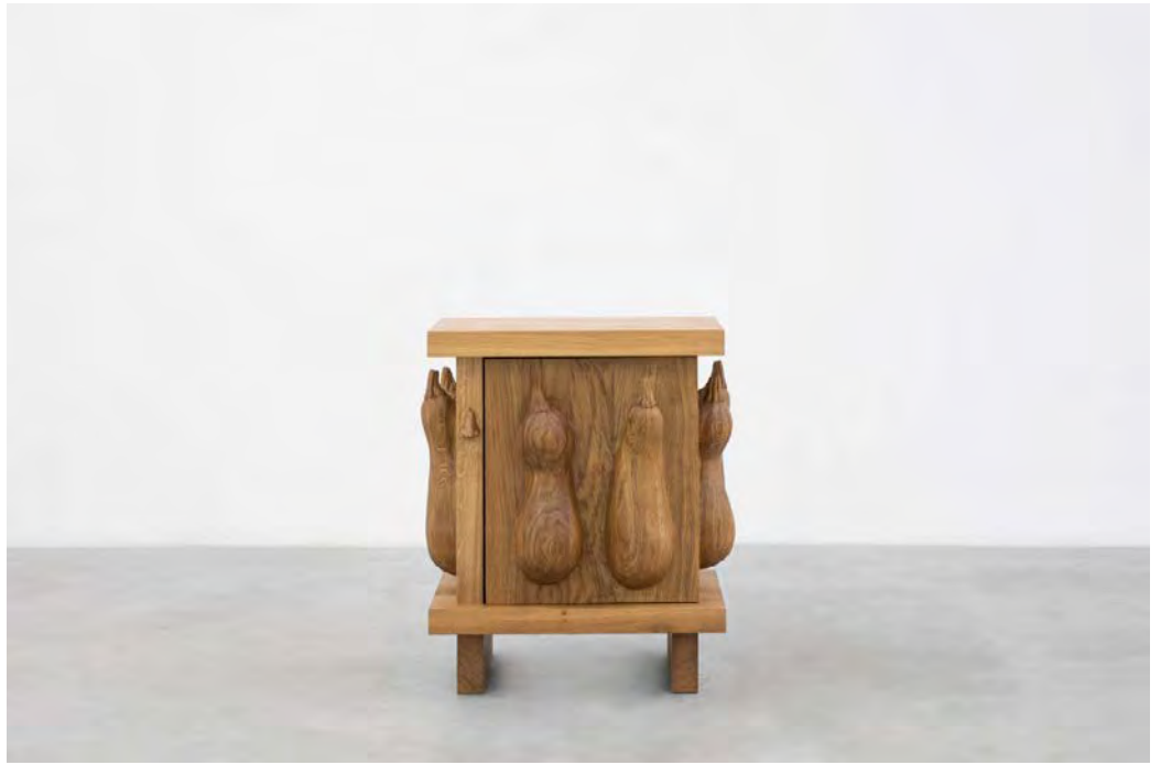
Daniel Dewar & Grégory Gicquel Oak cabinet with courgettes and nose, 2021

Oak wood 82 × 61 × 72 cm (32 1/4 × 24 × 28 3/8 in) Courtesy of the artists and Loevenbruck, Paris Inv. No. : DDGG210302