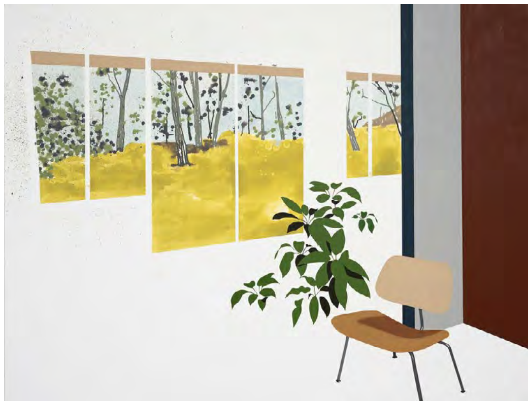
Blaise Drummond Palisades , 2013

Huile et collage sur toile 162 × 213 cm N° Inv : BD191016