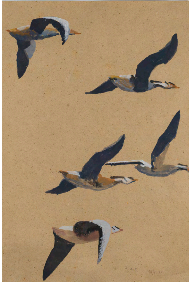
Gilles Aillaud Vol d'oiseaux , 1999

Gouache on brown paper 56,2 × 38 cm (22 1/16 × 14 15/16 in) Signed and dated, bottom right Inv. No. : GA220401