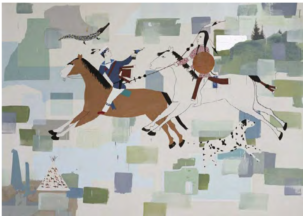
Blaise Drummond Indians of the Great Plains, 2022

Détrempe, collage et huile sur toile 190 x 270 cm N° Inv : BD221106