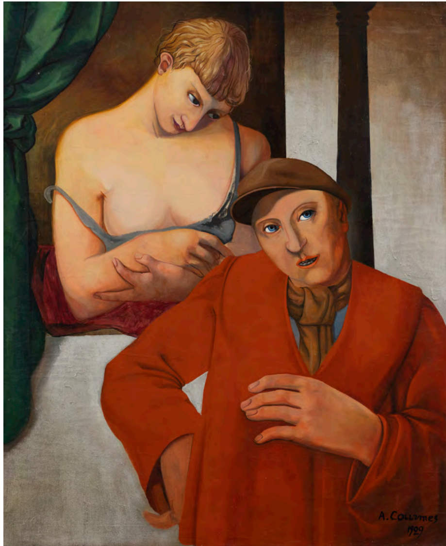
Alfred Courmes Au balcon , 1929

Oil on canvas 72 × 60 cm (28 3/8 × 23 5/8 in) Inv. No. : AC230101