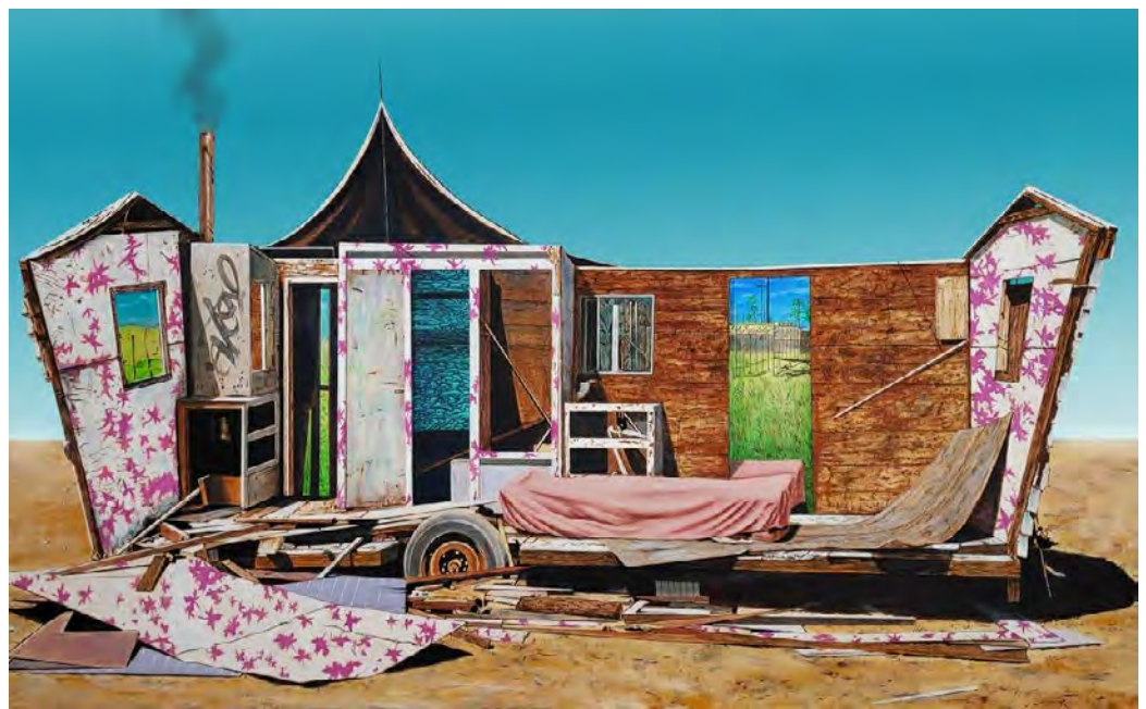
Philippe Mayaux Heterotopia: The Lost Palace, 2023

Acrylic and collage on canvas 100 × 160 cm (39 3/8 × 63 in) Inv. No. : PM230101